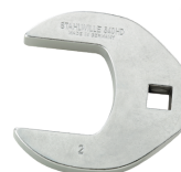
03501072 CROW-FOOT spanner heavy-duty inch