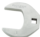
03501076 CROW-FOOT spanner heavy-duty inch