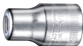
13180010 Bit holder