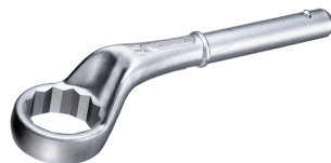
42020027 Heavy-duty ring spanner