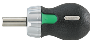
18120002 Ratcheting screwdriver bit holder