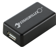
52110061 Interface adaptor