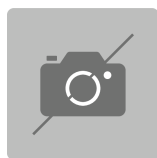
83071004 Inlay for plastic case