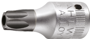
01351015 Screwdriver socket