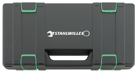
81271013 Socket set