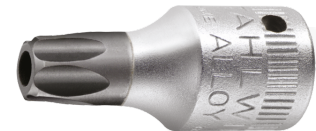
01351008 Screwdriver socket