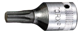
01350009 Screwdriver socket