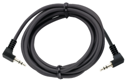
52110051 Jack cable