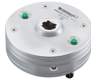
96524020 Transducers laboratory