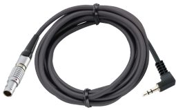
52110054 Cable for No.7728