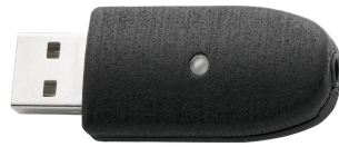
52111057 USB adaptor