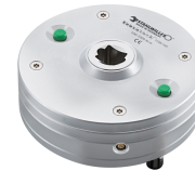
96524300 Transducers laboratory