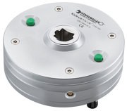
96524006 Transducers laboratory