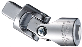
13020000 Universal joint