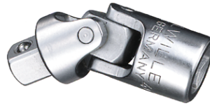
11020000 Universal joint