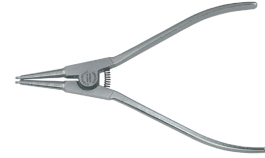
65454002 Circlip plier for outside circlips