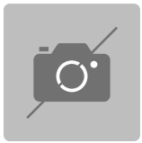
61012750 TCS inlay