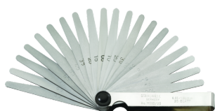
74240002 Precision feeler gauges