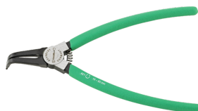
65466121 Circlip pliers for outer rings