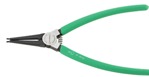
65456102 Circlip pliers for outer rings