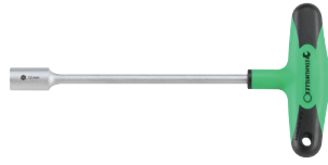
43232120 T-handled nut spinner