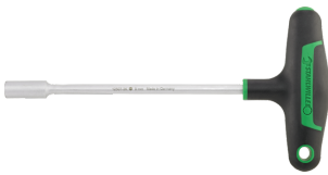
43233070 T-handled nut spinner