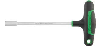
43233080 T-handled nut spinner