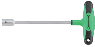
43232130 T-handled nut spinner