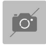
46223555 Screwdriver for slotted screws DRALL+