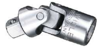
11020000 Universal joint