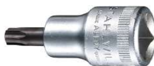
03100055 Screwdriver socket