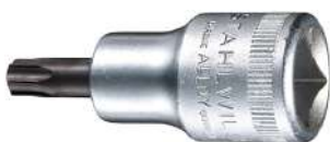
03100045 Screwdriver socket