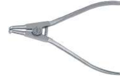
65464021 Circlip plier for outside circlips