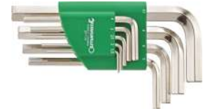
96431500 Set of hexagon key wrenches