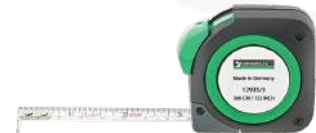
77040010 Tape measure