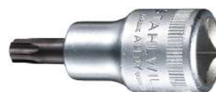
03100050 Screwdriver socket