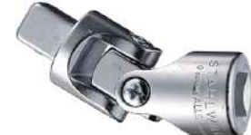
13020000 Universal joint