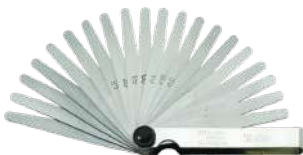
74240002 Precision feeler gauges