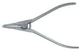
65454002 Circlip plier for outside circlips