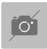
65434002 Circlip plier for inside circlips