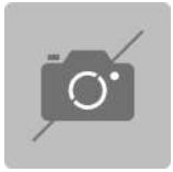
46223520 Screwdriver for slotted screws DRALL+