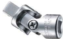
12020000 Universal joint