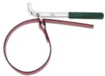
76500001 Strap wrench