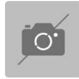
96432200 Key wrench