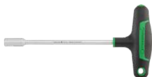
43233080 T-handled nut spinner