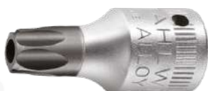
01351027 Screwdriver socket