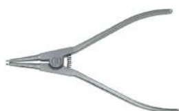
65454001 Circlip plier for outside circlips