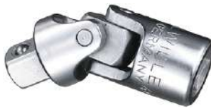
11020000 Universal joint