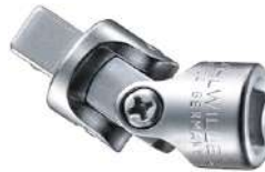
12020000 Universal joint