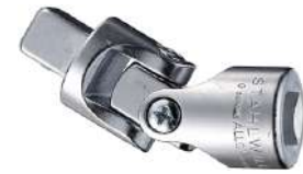
13020000 Universal joint