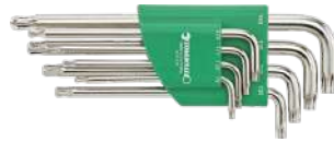
96432700 Hexagon key wrench