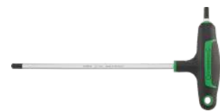
43253030 Hexagon key wrench