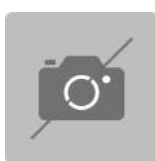
65434001 Circlip plier for inside circlips