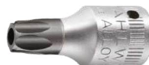
01351015 Screwdriver socket