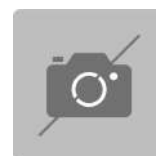
91100539 Packaging material