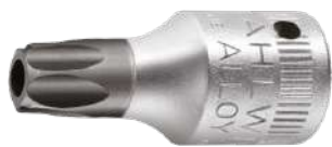
01351008 Screwdriver socket