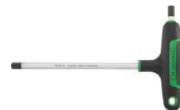
43253080 Hexagon key wrench