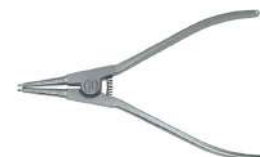
65454002 Circlip plier for outside circlips