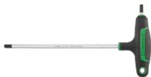
43253025 Hexagon key wrench