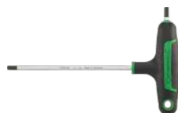
43253040 Hexagon key wrench