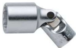
01140008 UNIFLEX sockets