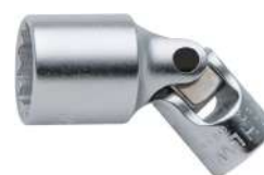
01140010 UNIFLEX sockets