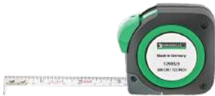
77040010 Tape measure