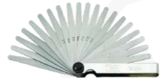
74240002 Precision feeler gauges