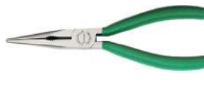
65296200 Snipe nose plier w.cutter (radio- or telephone pliers)