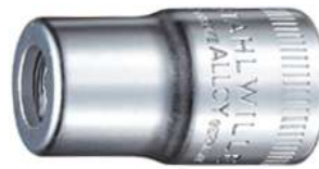
12180030 Bit holder