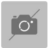
46223555 Screwdriver for slotted screws DRALL+