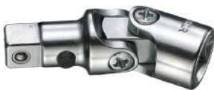
12021000 QuickRelease universal joint