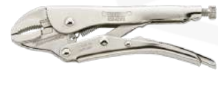
65642175 Self grip wrench