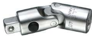
11021000 QuickRelease universal joint