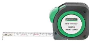
77040010 Tape measure