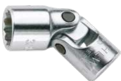
01541034 UNIFLEX sockets