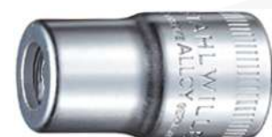
12180030 Bit holder