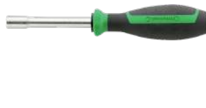
18073026 Spinner 2K-handle