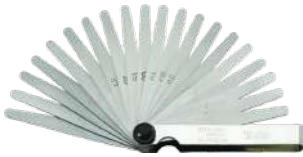
74240002 Precision feeler gauges