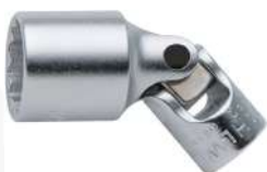
01540020 UNIFLEX sockets