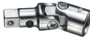
12021000 QuickRelease universal joint