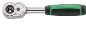
11131011 Bit ratchet