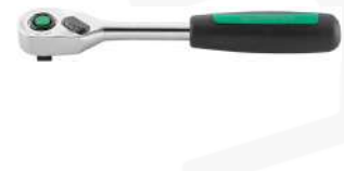
12111020 QuickRelease ratchet, fine tooth