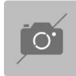
91100024 Packaging material