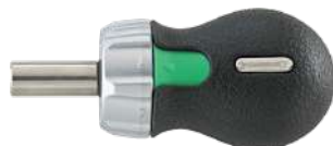
18120002 Ratcheting screwdriver bit holder