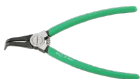
65466121 Circlip pliers for outer rings