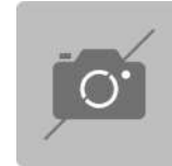
91100539 Packaging material