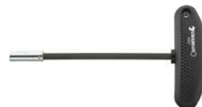
18090016 Bit holder T-handled