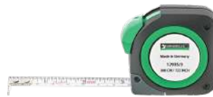
77040010 Tape measure