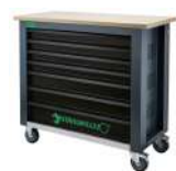
85010625 Mobile workbench