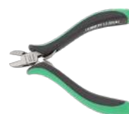
67086000 Mini electronic side cutter