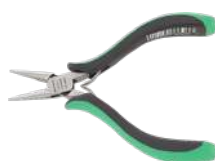
67116000 Electronic needle-nose pliers