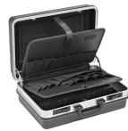
81620009 Tool box