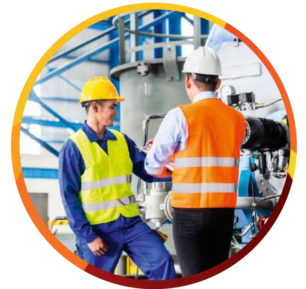
Industrial Technology Services