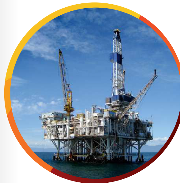
Project / Package Equipment