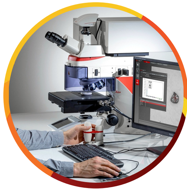
Laboratory & Inspection Equipment

PT Fajar Mas Murni provides complete professional services to its customers throughout Indonesia, including - but not limited to laboratory and inspection equipment, construction and mining equipment, industrial technology equipment and services, rotating equipment, project / package equipment and process equipment.