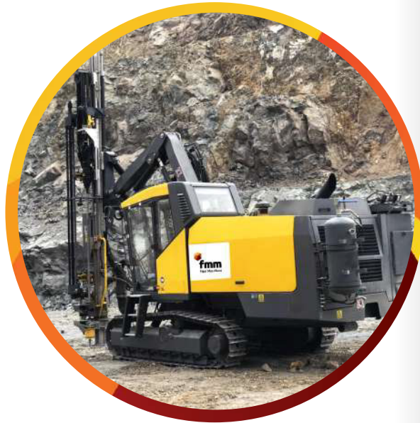
Construction & Mining Equipment

PT Fajar Mas Murni provides complete professional services to its customers throughout Indonesia, including - but not limited to laboratory and inspection equipment, construction and mining equipment, industrial technology equipment and services, rotating equipment, project / package equipment and process equipment.