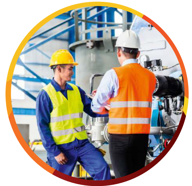
Industrial Technology Services