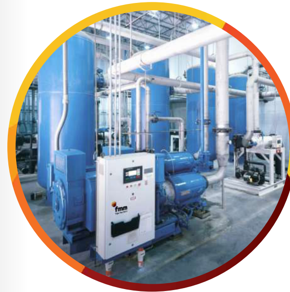
Industrial Technology Equipment